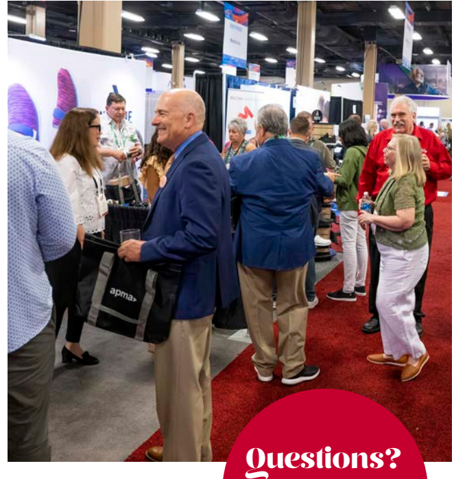
Exhibit at APMA meeting. Visit <u>www.apma.org/exhibits</u> for specific times and for set-up and dismantling schedule.